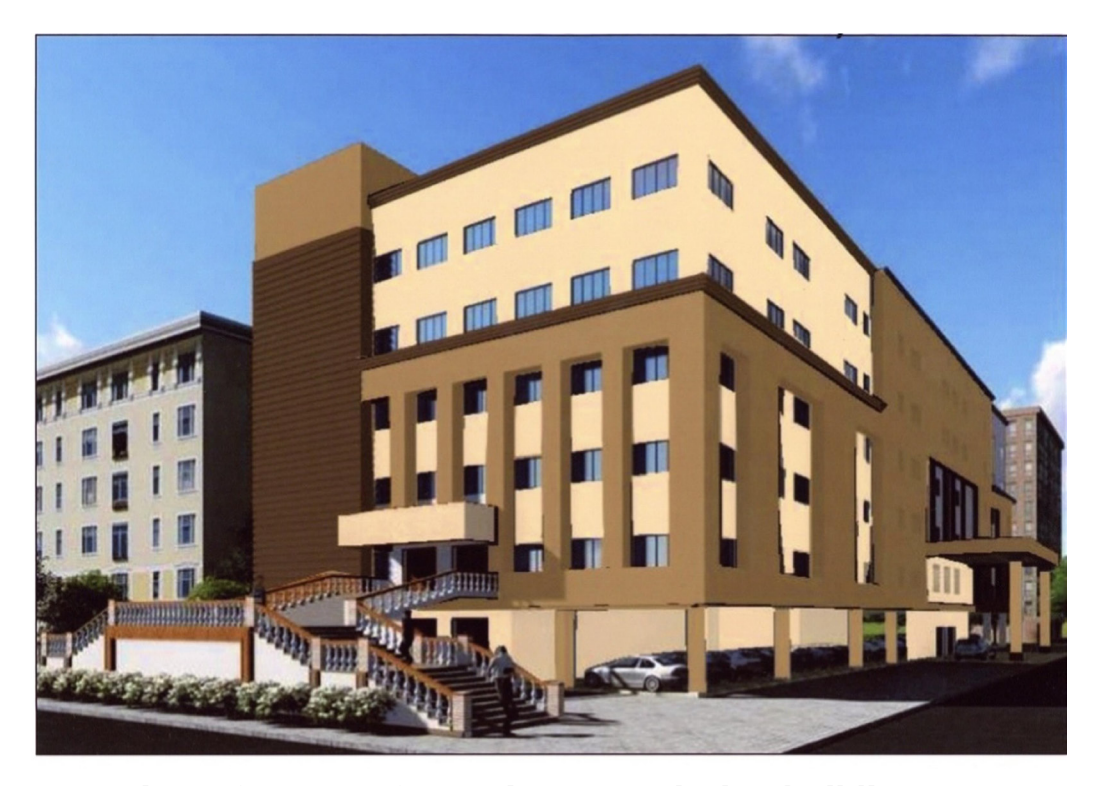
View of State Information Commission building at Government Farm Village, Pernpet, Nandanam, Chennai-35