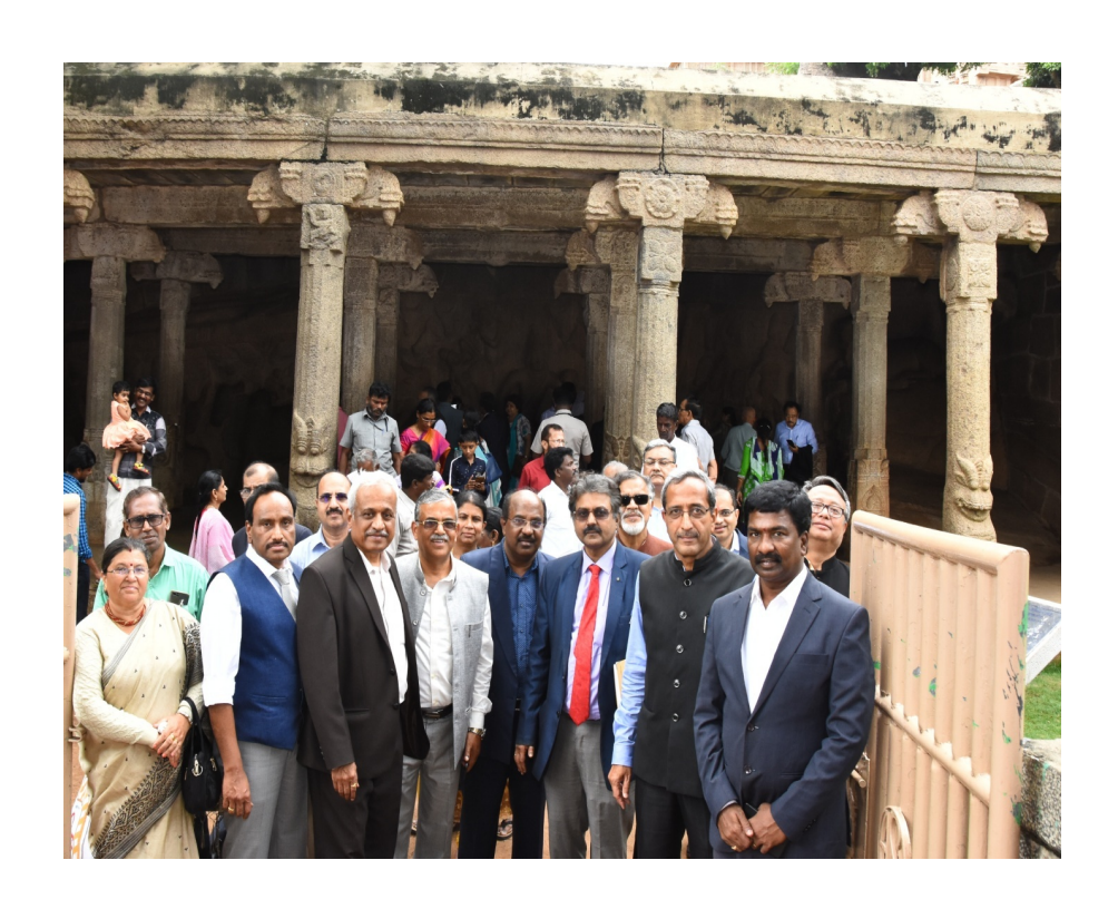
The Participants of NFICI meeting at a Heritage site in Mahabalipuram