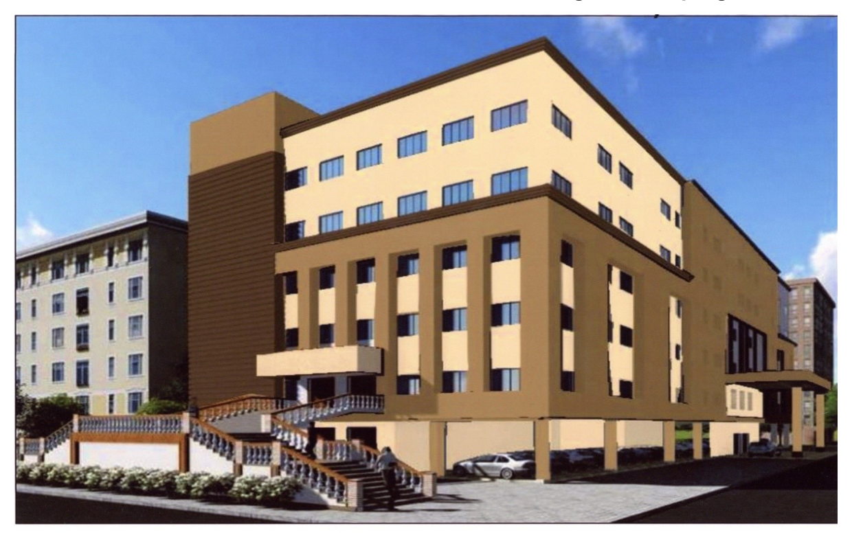
The tantative plan of the proposed Buling for T.N.S.I. Commission